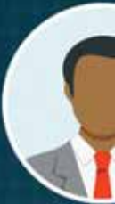
Customer relationship management