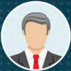
C-level executive management

A Digital Day is for anyone in your for change